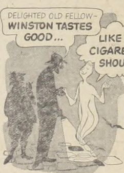
DELIGHTED OLD FELLOW-- WINSTON TASTES GOOD... LIKE A CIGARETTE SHOULD!