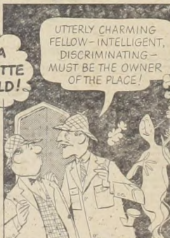
UTTERLY CHARMING FELLOW-- INTELLIGENT, DISCRIMINATING-- MUST BE THE OWNER OF THE PLACE!