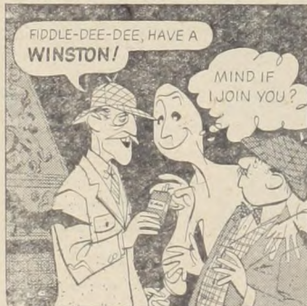
FIDDLE-DEE-DEE, HAVE A WINSTON! MIND IF I JOIN YOU?