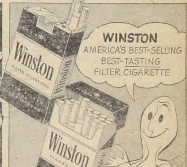
WINSTON AMERICA'S BEST-SELLING BEST-TASTING FILTER CIGARETTE

YOU'LL FIND THE NEW CRUSH-PROOF BOX UTTERLY CHARMING, TOO! ➔