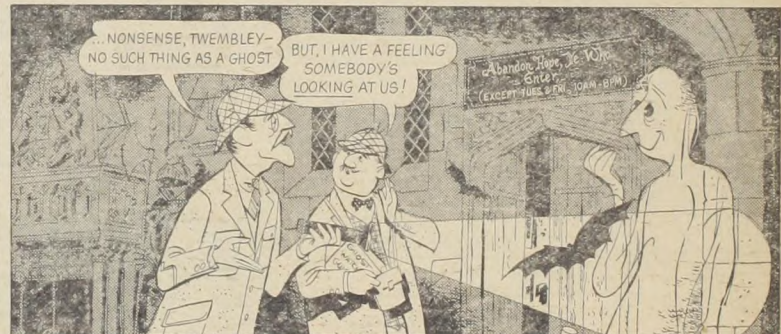
...NONSENSE, TWEMBLEY-- NO SUCH THING AS A GHOST BUT, I HAVE A FEELING SOMEBODY'S LOOKING AT US!