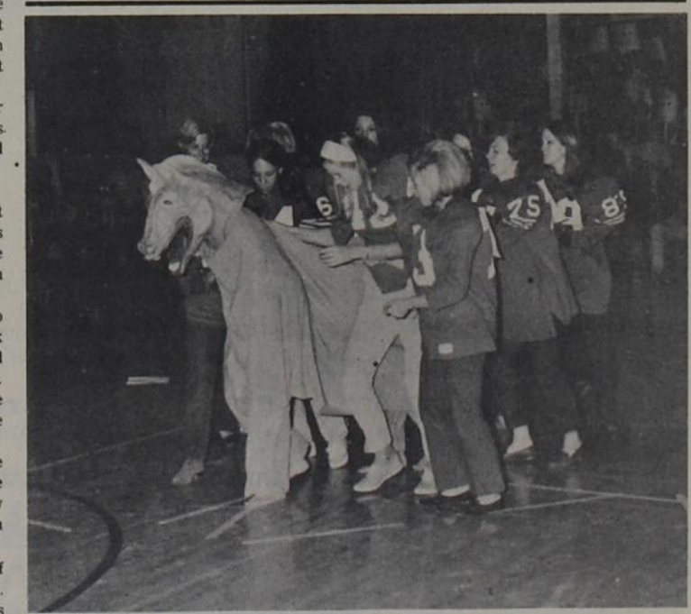
BEAT SMU SKIT-Members of Kappa Kappa Gamma sorority combine with Sigma Chi fraternity in presenting the skit at last night's pep rally. They won the spirit stick at last week's rally, and thus won the right to perform at the spirit meeting.