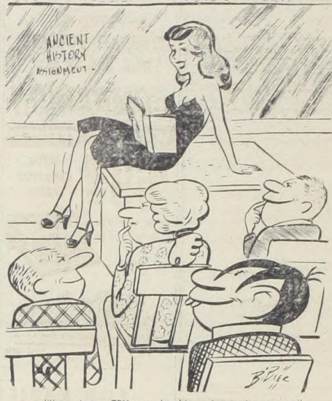
"I'm going to TRY to make this an interesting course