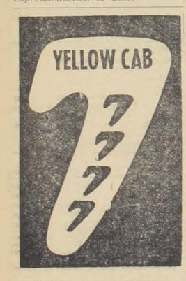
OWNED AND OPERATED BY EX-G.L'S