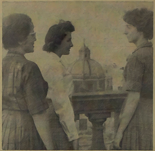
ee coeds look over the Basilica of Our Lady Guadalupe during the field trip in Mexico.

an article of clothing. To the uninitiated, it might seem that the Mexican people would resent the Americans' attempts to conquer the native tongue, but it's not so. The average Mexican delights in speaking with students of his language, and even in trying to help whenever he can. Many times a student has learned the meaning of a new word through a description given in Spanish.