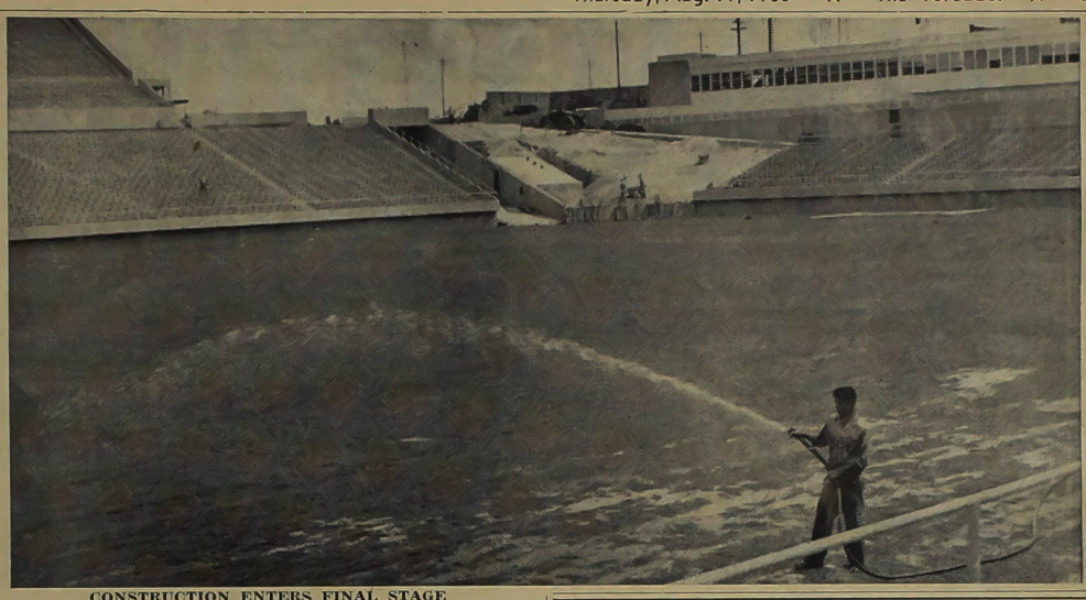
CONSTRUCTION ENTERS FINAL STAGE Preparations for the pouring of the last section of seats (upper center) began this week.

Lubbock Radiator Service All work guaranteed 1212 Ave. H PO 3-3850