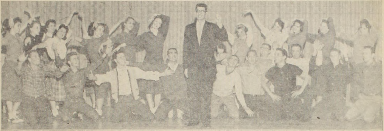
LAST MINUTE rehearsal proceeds with the cast of this year's Varsity Show entitled "Something for Nothing."