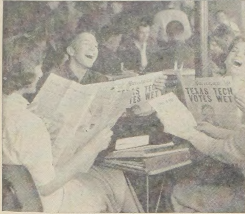
THESE TECHSANS don't appear worried about the serious problems set before them in the "Toyletdoor." In fact they seem to enjoy being fooled by the April 1 edition of the Toreador. Publication of the "Toyletdoor" is a fund raising project of Sigma Delta Chi, men's journalism fraternity.