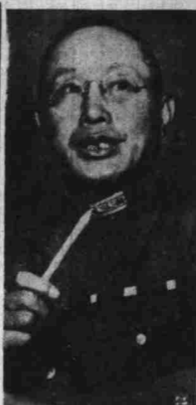
BECOMES CHINA'S PREMIER —Gen. Ho Yong-Chin (above), former defense minister, became the premier of Nationalist China.

Committee. Thomas' committee already has okayed an administration bill to repeal Taft-Hartley and restore the old Wagner Labor Law with some additions.