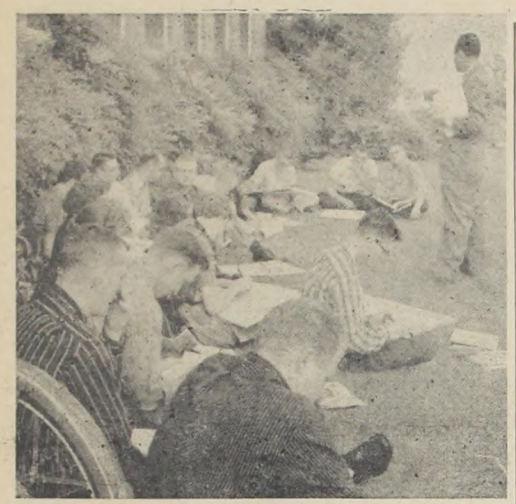
ted's journalism typography class having to meet on the lawn in front of the Journalism Building. Since their room has not been completed due to expansion in the building, and since there was no other ovailable room, the class met outside yesterday.