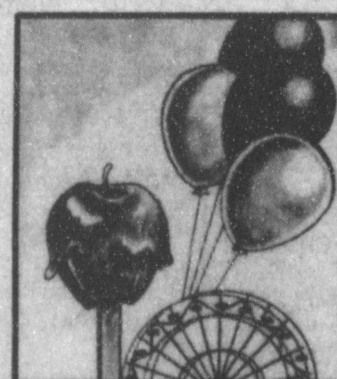
69th Annual Panhandle South Plains Fair September 20 - 27

Over 30 balloons take to the air both mornings at sunrise for a day of "balloon tag". The event is held in conjunction with the Reese Air Force Base open house and all proceeds go to Lubbock's Ronald McDonald House. Free Admission.