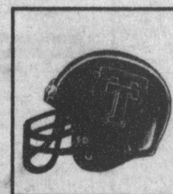
Texas Tech University Homecoming September 27th

Fair Park, Broadway & Avenue A. Featuring fun for everyone with exhibits, entertainment, contests, livestock show, carnival rides and live variety shows.