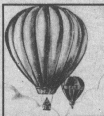
Lubbock's Second Annual Hot Air Balloon September 13 & 14

It's Lubbock's third annual salute to the wine industry. Wineries from across the nation will be serving both the connoisseur and the novice. Events include seminars, tastings and gourmet meals. Ticket information available.