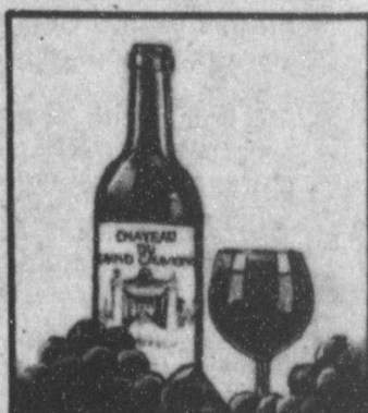
Texas International Wine Classic at Lubbock September 12 & 13