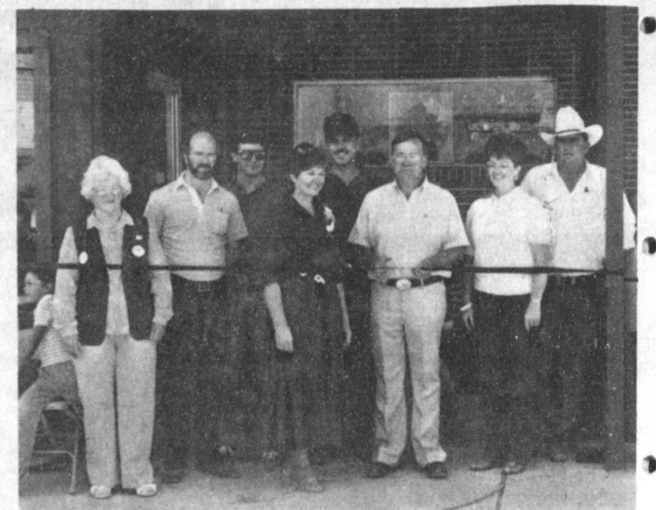
RIBBON CUTTING CONDUCTED --On Saturday, August 9, the Muleshoe Chamber of Commerce and Agriculture conducted ribbon cutting ceremonies for Joe's Boot Shop and Country Junction located at the 'Crossroads' in Muleshoe. Live entertainment and refreshments helped the all-day celebration at the new business in Muleshoe.