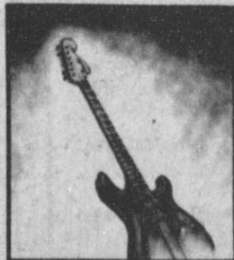
Lubbock Music Festival September 1 - 7

A week to celebrate, reminisce, to enjoy... packed with musicians, concerts, and events. Highlighting the week is Friday's concert with Carl Perkins and Friends, Ace Cannon, Bo Diddley, The Crickets, Bobby Vee, Del Shannon, Buddy Knox, Sonny Curtis and the Rockin' Ricochettes.