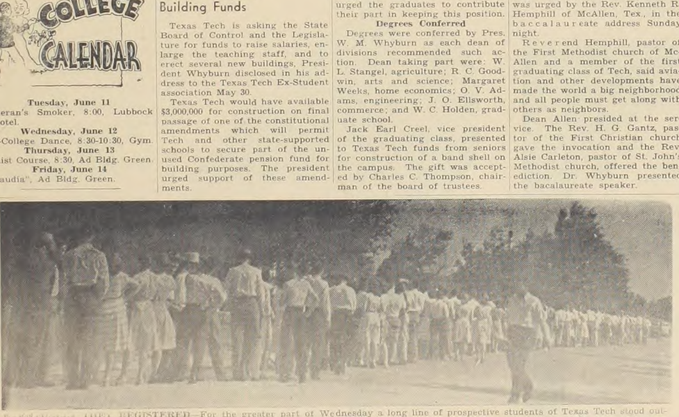
THE REGISTERED For the greater part of Wednesday a long line of prospective students of Texas Tech stood out instration building waiting to register for the summer term. Here the line at mid-morning extended for more than two ie north door of the building, on around the east side and south well past Fourteenth street. The boy to the right is cross intersection to take his place to the south.