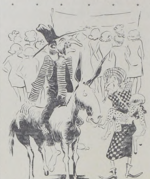
"Might jest ez well send 'im to Hardin-Sir females air too smart fer 'im hyar."