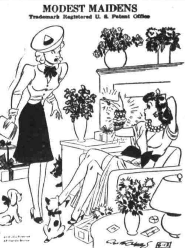
"Sometimes I wish he didn't love me so much!"