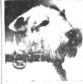
Dobbin Gets a Gas Mask

28-page booklets to prove it. These thousands organized to take care of their 45,000,000 domestic animals, yes, they counted them.