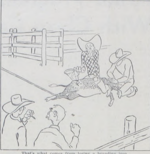
That's what comes from losing a branding iron.