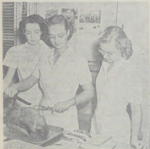
THANKSGIVING is a long way off, but these foods and nutrition students are all set to carve the turkey. They will be working at the Home Ec open house which starts Friday.