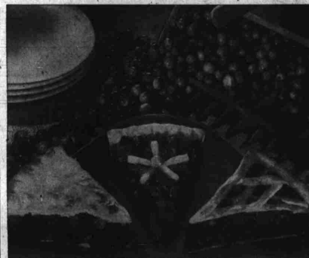
THEY'RE THE BERRIES: Or cranberries, in this instance, for Thanksgiving pies and sauce that make second helpings automatic.