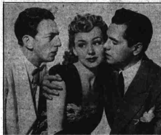
Ray Bolger, Anne Shirley and Desi Arnaz in "Four Jacks and a Jill."

RKO-Radio and Monogram pictures dominated the preview field this past week, with RKO's "FOUR JACKS AND A JILL" in the top spot.