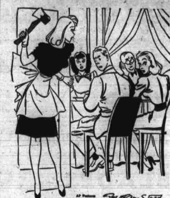
"Please just be patient, folks."