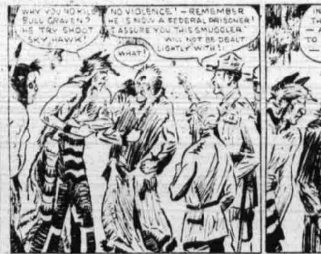
WHY YOU NO VIOLENCE? - REMEMBER BULL DOGG? HE'S NOW A FEDERAL PRISONER! HE TRY SHOOT AT ASSURE YOU THIS SMUGGLER WILL NOT BE DEALT LIGHTLY WITH!