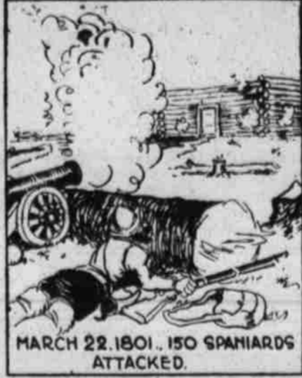
MARCH 22, 1801. 150 SPANIARDS ATTACKED.