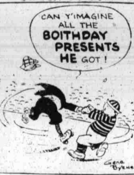
CAN Y'IMAGINE ALL THE BOITHDAY PRESENTS HE GOT!