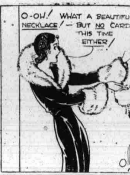
O-OH! WHAT A BEAUTIFUL NECKLACE! - BUT NO CARD THIS TIME EITHER!