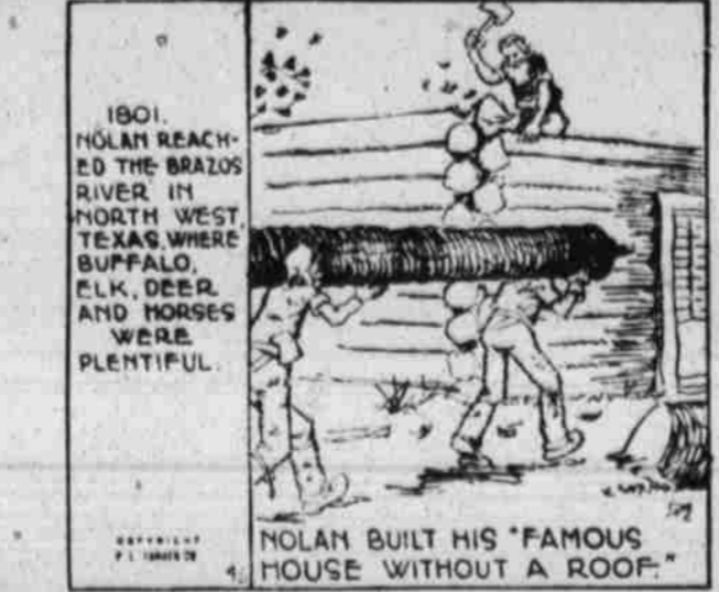
1801. NOLAN REACHED THE BRAZOS RIVER IN NORTH WEST TEXAS WHERE BUFFALO, ELK, DEER, AND HORSES WERE PLENTIFUL.