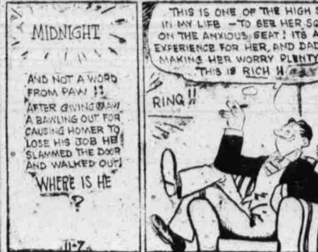
MIDNIGHT AND NOT A WORD FROM PAW!! AFTER GIVING PAW A BAWLING OUT FOR CAUSING HOMER TO LOSE HIS JOB HE SLAMMED THE DOOR AND WALKED OUT! WHERE IS HE?