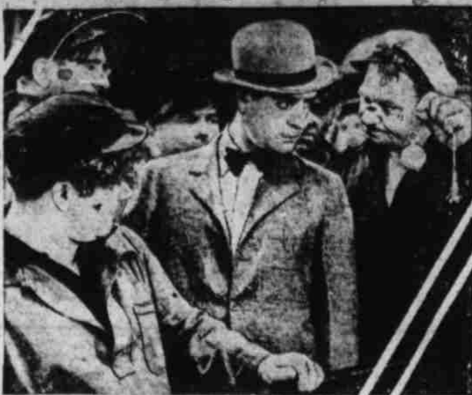
JIM TULLY, JOHN GILBERT and WALLACE BEERY in "WAY FOR A SAILOR"

Playing "low-brow" roles in talkies is much harder than accomplishing similar characterizations in silent films.