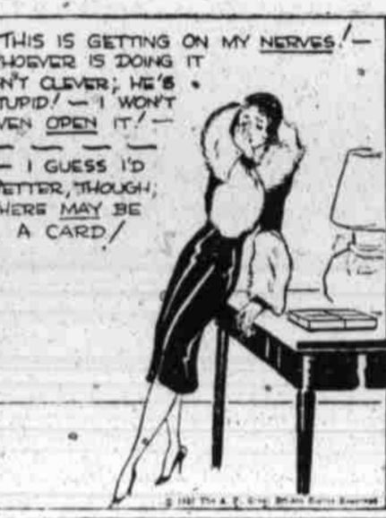
THIS IS GETTING ON MY NERVES! - WHOEVER IS DOING IT ISN'T CLEVER; HE'S STUPID! - I WON'T EVEN OPEN IT! - I GUESS I'D BETTER, THOUGH; THERE MAY BE A CARD!