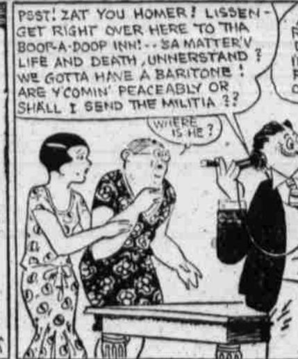
POST! ZAT YOU HOMER! LISSEN GET RIGHT OVER HERE TO THA BOOP-A-DOOP WINE! - SA MATTER V LIFE AND DEATH, UNNERSTAND? WE GOTTA HAVE A BARITONE! ARE Y'COMIN' PEACEABLY OR SHALL I SEND THE MILITIA??