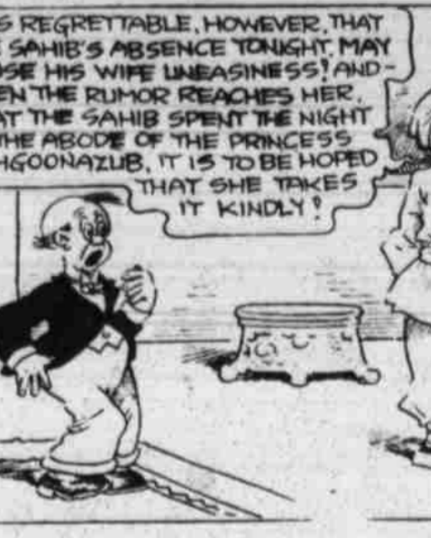
IT IS REGRETTABLE, HOWEVER, THAT THE SAHIB'S ABSENCE TONIGHT MAY CAUSE HIS WIFE UNEASINESS, AND WHEN THE RUMOR REACHES HER, THAT THE SAHIB SPENT THE NIGHT AT THE ABODE OF THE PRINCESS RAHGOONAZUL, IT IS TO BE HOPED THAT SHE TAKES IT KINDLY!