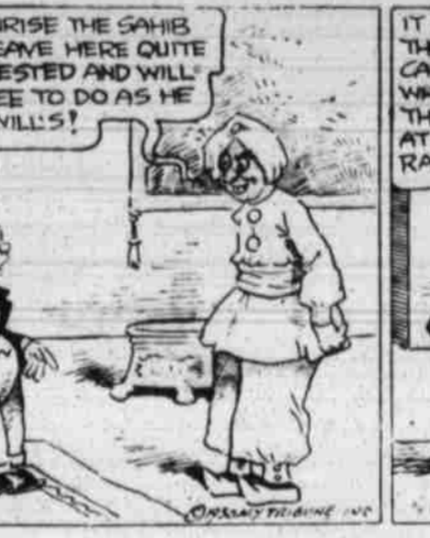
AT SUNRISE THE SAHIB MAY LEAVE HERE QUITE UNMOLESTED AND WILL BE FREE TO DO AS HE WILLS!