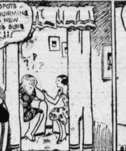
THIS IS ONE OF THE HIGH SPOTS IN MY LIFE - TO SEE HER SQUIRMING ON THE ANXIOUS SEAT! ITS A NEW EXPERIENCE FOR HER, AND DADS SURE MAKING HER WORRY PLENTY!! THIS IS RICH H...