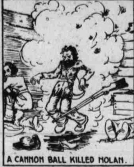
A CANNON BALL KILLED NOLAN.