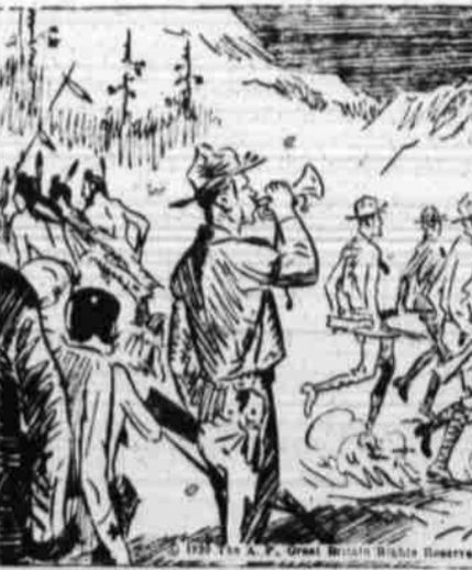
OH, THANK YOU COLONEL SPARKS; JUST THE SAME - BUT SCORCHY WILL TAKE CARE OF ME, I AM SURE!