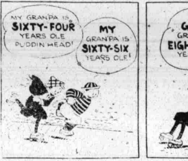
MY GRANPA IS SIXTY-FOUR YEARS OLE PUDDIN' HEAD!