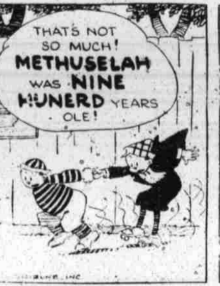
THAT'S NOT SO MUCH! METHUSELAH WAS NINE HUNDRED YEARS OLE!