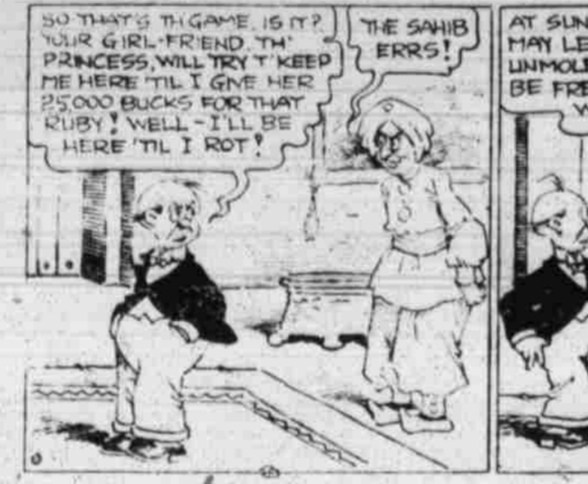
SO THAT'S THE GAME, IS IT? YOUR GIRL-FRIEND, THE PRINCESS, WILL TRY TO KEEP ME HERE 'TIL I GIVE HER 25,000 BUCKS FOR THAT RUBY! WELL - I'LL BE HERE 'TIL I ROT!