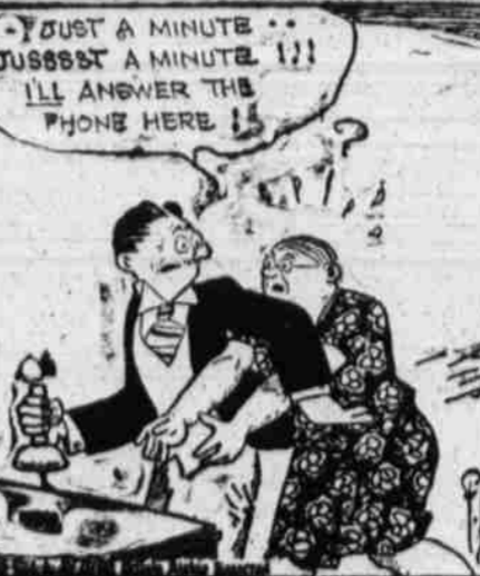
-JUST A MINUTE - JUSSEBT A MINUTE!!! I'LL ANSWER THE PHONE HERE!!