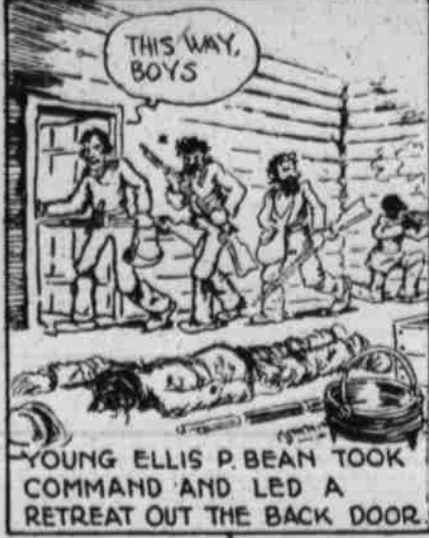
YOUNG ELLIS P BEAN TOOK COMMAND AND LED A RETREAT OUT THE BACK DOOR.