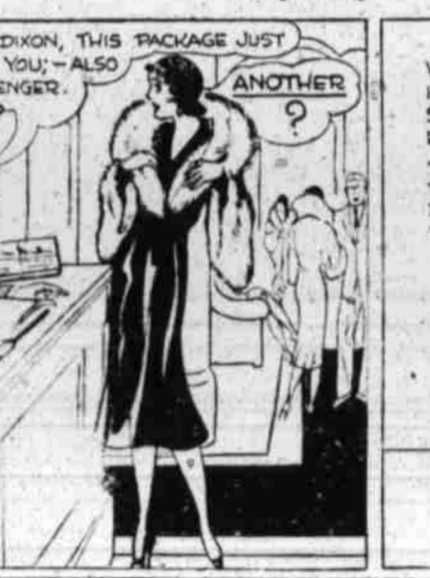
OH, MISS DIXON, THIS PACKAGE JUST CAME FOR YOU; - ALSO BY MESSENGER. - ANOTHER?