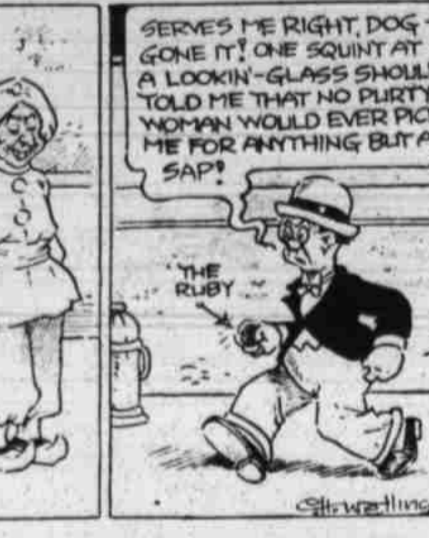
SERVES ME RIGHT, DOG-GONE IT! ONE SQUINT AT A LOOKIN'-GLASS SHOULD TOLD ME THAT NO PURTY WOMAN WOULD EVER PICK ME FOR ANYTHING BUT A SAP!