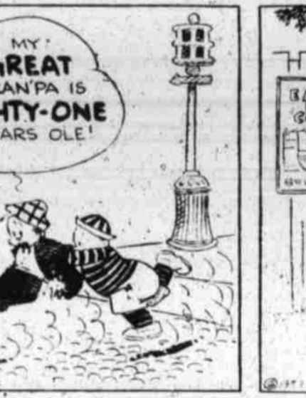
MY GREAT GRANPA IS EIGHTY-ONE YEARS OLE!