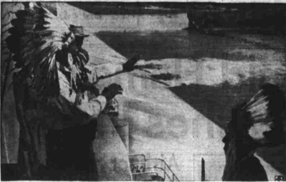
No Fish Shall Bite

No fish shall bite says Chief Henry Spotted Cow as waters flow from Canton, Okla., Reservoir, 100 miles downstream to moisture-hungry Oklahoma City. Indians in an ancient ceremony, cursed the waters, claiming palefaces at the state capital are ruining their hunting and fishing grounds.