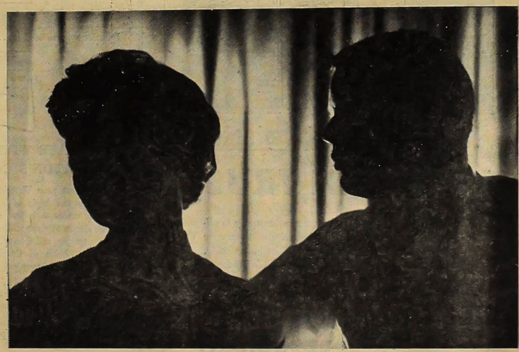
FIRST DATE QUESTIONS-She: "Will he?" He: "Should 1?" For techniques, see feature on page 8