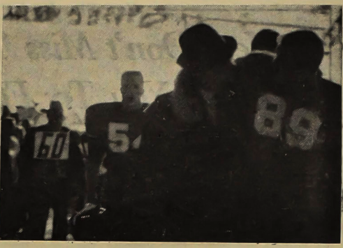
HAPPY RAIDERS, HAPPY DADS! ... it's all over but the shouting.

LET'S GET A BEAR! The gleam in their eyes indicated they may do just that.