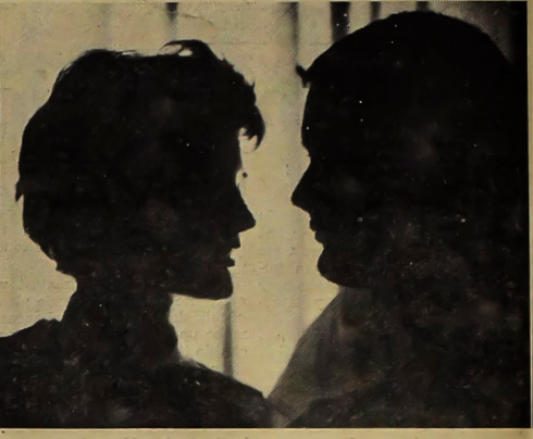
"Are you one of the bad boys Mommy told me about?"

But if nothing such as the a-foresaid happens—Gung Ho!!