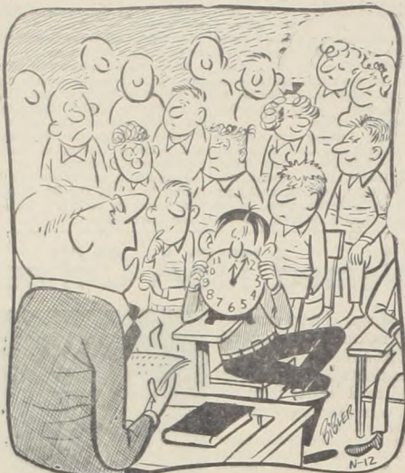
"I SEE I'VE LECTURED PAST THE BELL AGAIN."