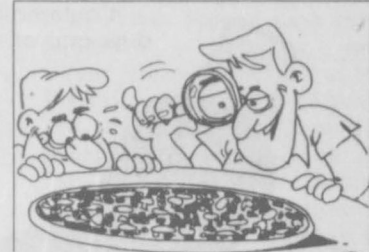
Today's top pizza makers are working on the ultimate pizza recipe.

For further information call the State Coordinator or TOLL FREE: 1-800-SIBLING.