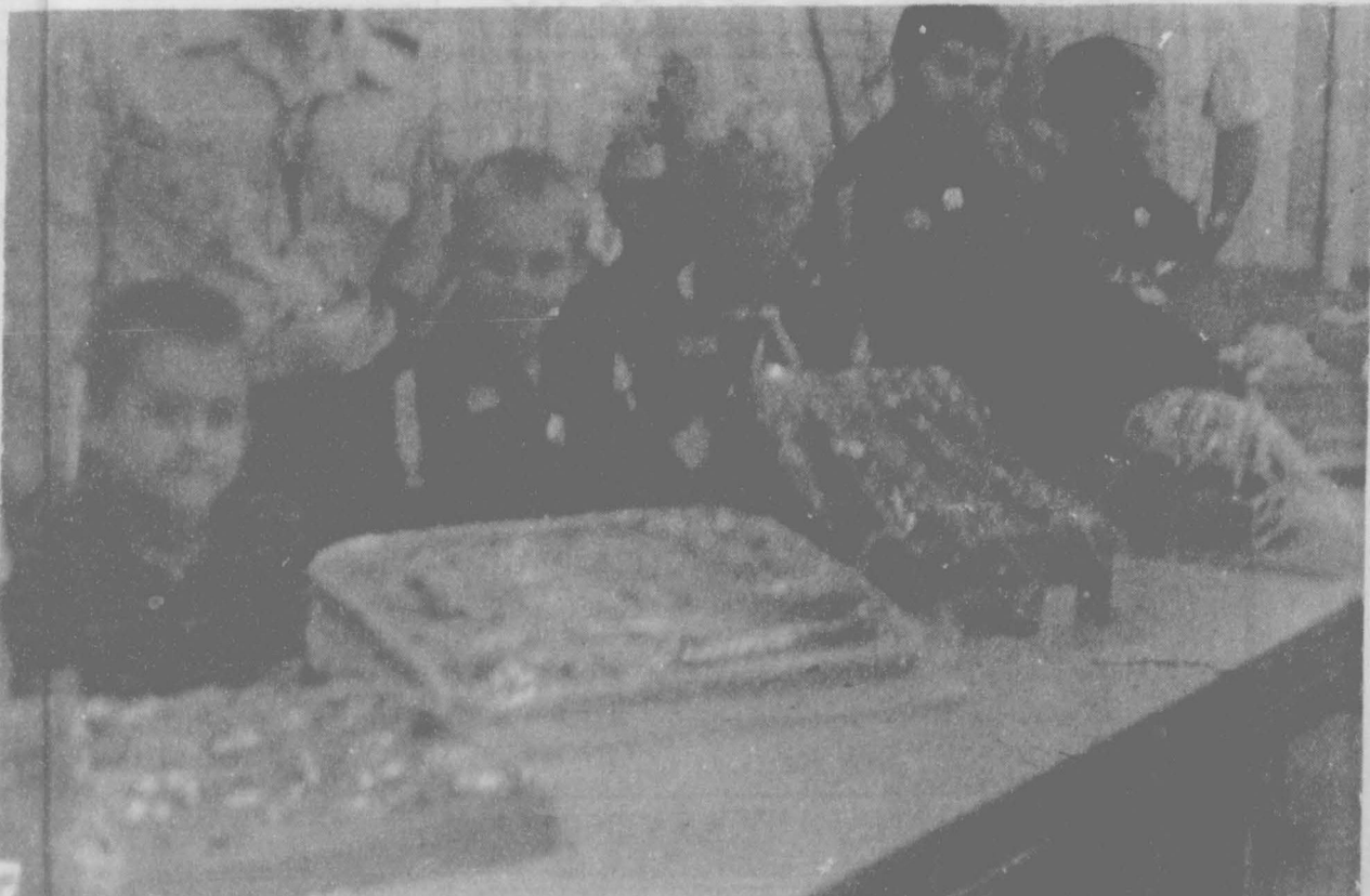
These are the scouts that placed in the Dad-Lad cake bake. Standing behind them are their dads which are not visible due to the fact that the cakes are pictured. There were octopuses, whales, treasure chests and

helping the Cub Scouts at the Dad-Lad Cake Bake and Sale.