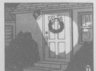
A wreath highlighted with a clear spot bulb creates a warm holiday welcome.