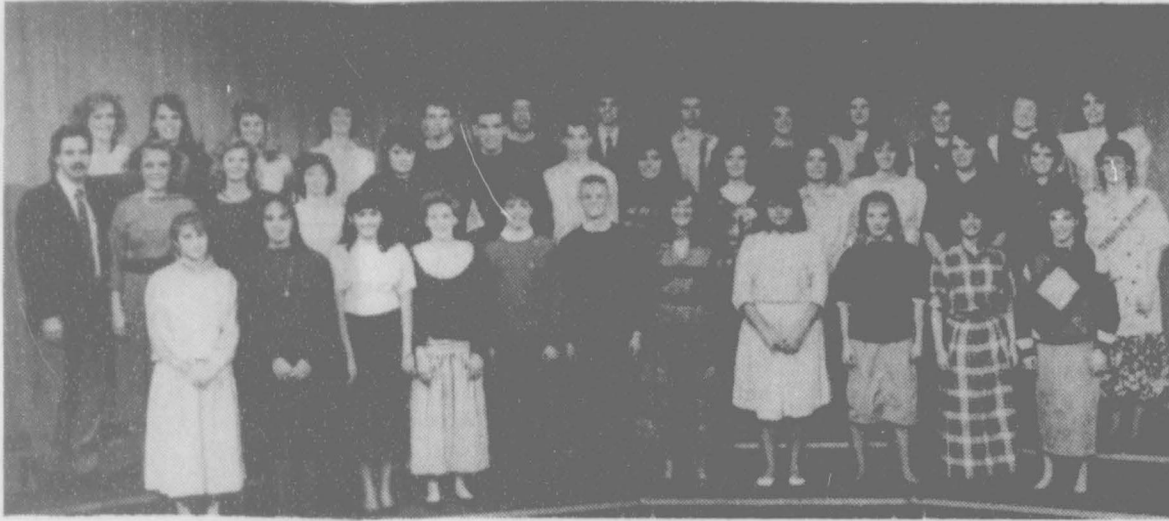
The Spearman Celebrate Twelve and Spearman High School Choir will produce sounds of Christmas as members perform Monday, December 19 at noon on KACV-TV, public television for the Panhandle.