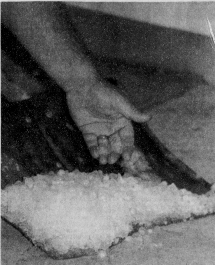
MOISTURE IN 1987 CAME IN ALL FORMS . . . from scoops of hail in May to almost blizzard-like conditions in December, the year just ended goes down in the history books as one of the wettest of the last decades with 26.70 inches of precipitation which includes over 60 inches of snow last winter and this fall, hail, high winds and tornadoes last spring and an otherwise mild summer.