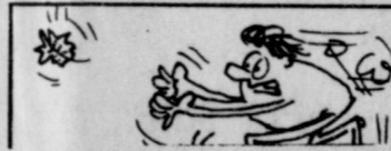
People believe if you catch a falling leaf, you will have a good and happy life.