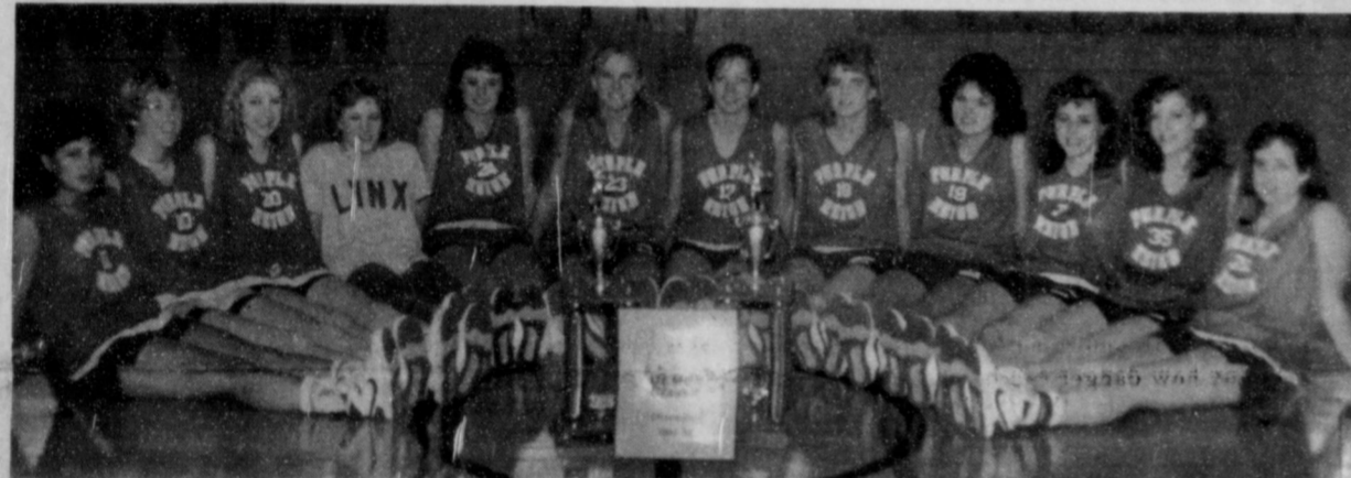
THE SPEARMAN LYNXETTES POSE WITH THEIR THREE TOURNAMENT TROPHIES.

The publisher reserves the right to revise or reject at its option any advertisement which it deems objectionable, either in subject or phraseology, or which it may deem detrimental to its business.