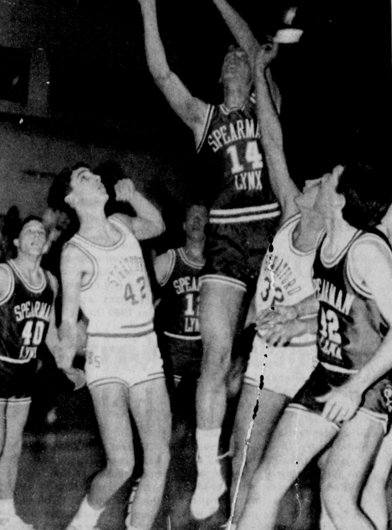
THINGS WERE CLOSELY PACKED . . . but the Spearman Lynx managed to come from behind and steel the district 1-AA basketball championship out of the grasp of the Stratford Elks in Dumas last Friday.