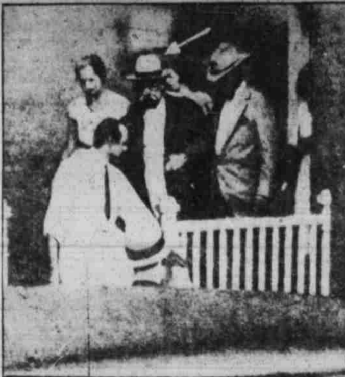
Albert S. Fall (indicated by arrow) is shown as he left his home in El Paso, Tex., to begin the trip to the New Mexico penitentiary at Santa Fe, where he was sentenced to serve a year and a day for accepting a bribe when secretary of the interior.

Corn grown at the University of Texas last year reached a height of 13 feet and has spent the past two weeks and visited eight towns or villages in Florida.