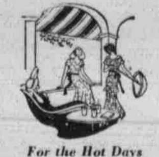
For the Hot Days

Garden-party gowns are as gay as the flowers that bloom in the gardens themselves. They come in all the lovely sheer mousselines and chiffons, crepe georgettes and double and triple crepes. One of the dressmakers uses white crepe mousseline encrusted with brown lace for a charming garden-party dress. Below the clinging corsage, a fitted tunic is bordered with delicate lace insets which match two lower flounces. He also applies black lace in loose raised flower designs on a large-flowered pale gray chiffon, in which a tracery of black supplies the leaves and stems. Garden-party gowns are made up in quaint line suggesting mid-victorian. Sometimes a tiny capelet does the business of a sleeve, the fitted waist bound by a tiny girle and the skirt tight at the hips, shaped to flow out at the lower edge. An interesting novelty for a garden-party gown comes in a revival of silk cashmere weave, offered with tiny motifs half faconne and half-printed. It is inspired by silks of fifty years ago.