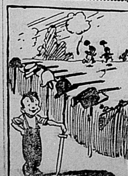
MICKEY'S STRATEGY WINS A BATTLE