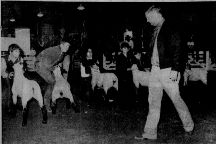
the lamb judging was going on inside the county barn...