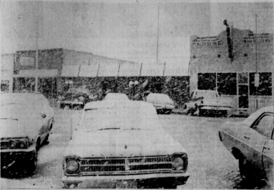
While it was snowing outside Saturday morning in Spearman,