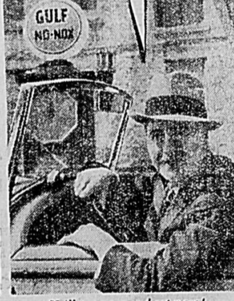
He'll pay more and get more!

3 kinds of gasoline for 3 kinds of buyers!