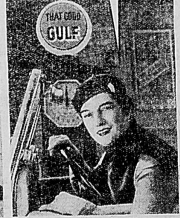
She's a shrewd shopper!