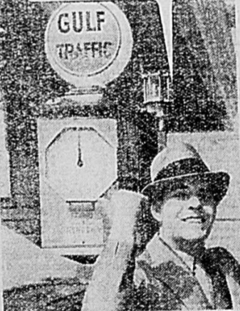
He knows his low-priced gasoline!