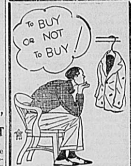
Figure With Us