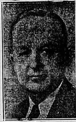
By MARVIN JONES

The Southwest is very much interested in the question of soil erosion. No other question is more vital to our section of the country.