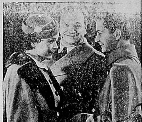
Maureen O'Sullivan, Wallace Beery, Robert Young in "West Point of the Air"