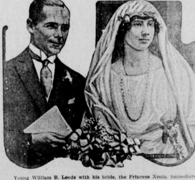
Young William B. Leeds with his bride, the Princess Xenia, immediately after the civil marriage in Paris at the mairie of the premier arrondissement church by St. Germain's church.