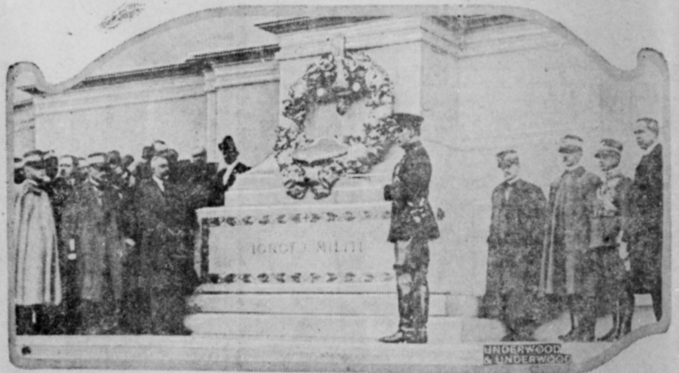
Gen. Henry T. Allen, commander of the American army of occupation, is here shown decorating with the Congressional Medal of Honor the tomb of the "Ignoto Militi" or unknown soldier of Italy. Prominent in the group are Gen. Diaz, Premier Bonomi and American Ambassador Richard Washburn Child.

America Decorates Italy's Unknown Soldier