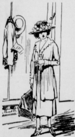
Cast One Last Glance About.

Each day on leaving for the office, his final admonition to Bab was to keep her hands off the papers on his