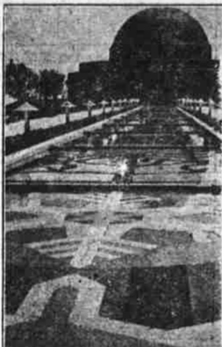
The millions of visitors who saw the 1933 Century of Progress Exposition at Chicago and who return to see the 1934 Fair will find radical differences in coloring and lighting effects. New buildings, new color and lighting schemes and many new exhibits will make practically a new Fair. The above picture shows a bit of the color and lighting effects along the basin leading to the Planetarium where myriad colored lights playing downward into the clear waters of the basin and on to the brilliantly colored pattern over which the waters flow create a veritable fairyland effect.