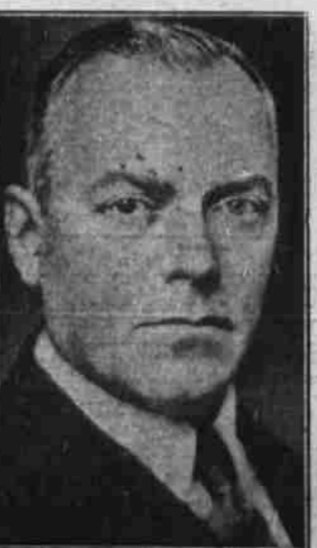
Walter G. Teagle is president of the Standard Oil company of New Jersey, defendant in a suit filed in the District of Columbia supreme court by the federal government for alleged violation of the oil code. The action sought an injunction to prevent the company from giving premiums in a contest conducted by radio by Bob Ruth.