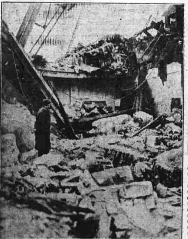
These were the ruins of a mine near Duchov, Czechoslovakia, after the recent explosion which took the lives of 140 men working there. Only four escaped alive.