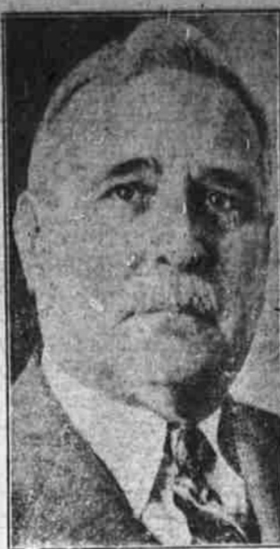
Strong political support of Col. Carlos Mendieta as the latest president of Cuba gave rise to the opinion that recognition of the island republic by the United States had become a definite possibility.