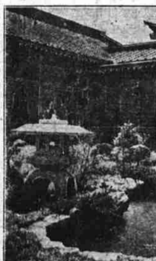
In the extensive rebuilding and elaboration of the Japanese government buildings and exhibits for the 1934 Century of Progress Exposition at Chicago the added attractiveness of the gardens is to play a prominent part. So much that is new in the gardens, the buildings and the exhibits will be shown that the 1933 visitors will not recognize the complete exhibit as one they saw last year. The above picture shows a small corner of the gardens that are being radically made over for the 1934 Fair.