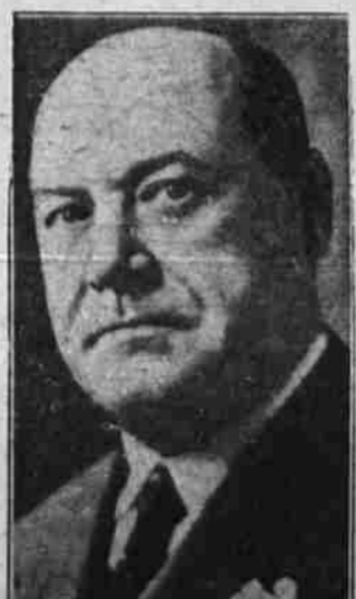
Charges of embezzlement were filed in Tulsa, Okla., against Harry F. Sinclair (above), oil magnate and 24 other Tulsa financial leaders, in connection with the crash and spring of the Exchange Trust company.