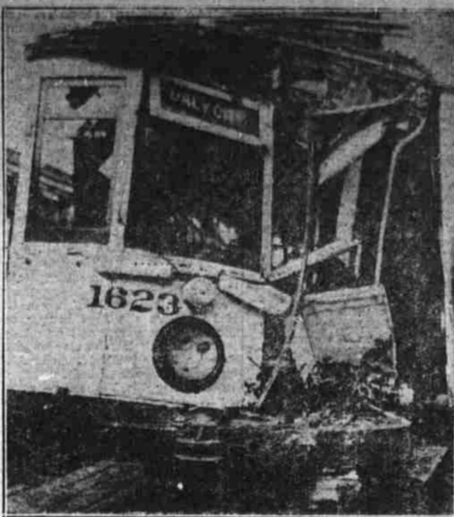
Thirty-four persons were injured in a head-on collision between two street cars in San Francisco. Here is the wreckage of one of the cars in the accident, which witnesses said seemed due to a split switch.