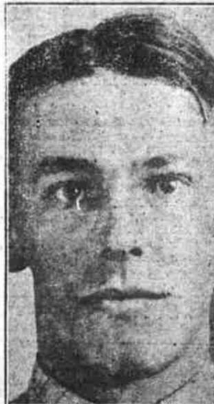
Neal Glendon Bowman, 30 (above), member of the notorious Bowman gang of desperados, was widely sought after he escaped from the Ohio hospital for the criminal insane at Lima.