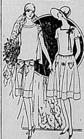
Dress No. 3894 Dress No. 3899

A lovely gown of chiffon or Georgette for the bride with a demurely picturesque gown of taffeta for the bridesmaid.