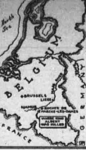
This map shows the location of the Rocher de Marche-Dames, where King Albert of Belgium lost his life while mountain-climbing.