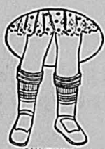
SULTANA CHILDREN'S SOX

Next Monday, August 5th., is our regular DOLLAR DAY. And for this day we have chosen specials that are really worth your consideration. School will be starting in five weeks; lay in a supply of material for the youngsters Dollar Day