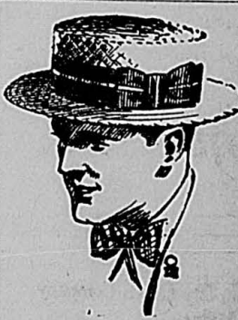
MEN'S STRAW SAILORS

an assortment of good styles, all sizes, valued from $1.90 to $3.90.