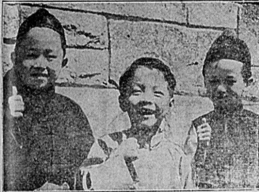
These three little Chinese boys give the ancient Chinese greeting of good cheer familiar to all Americans who visit China. Centuries old, this gesture is accompanied by the Chinese salutation, "Ding Kwa Kwa," which the British have aptly translated into their wartime greeting, "Are we downhearted? No!" The Chinese, too, meet every bombardment, every battle, every trying moment with this slogan of determination and courage to smash aggression . . . and they do it with a smile.