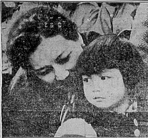
Madame Chiang Kai-shek comforts a shy newcomer to one of the war-orphanages she maintains in Chungking with the aid of American relief funds. Childless herself, China's First Lady is a real "mother" to more than 30,000 homeless waifs rescued from starvation and receiving food, clothing and shelter under her care. Relief of China's war-stricken children is a major objective of the United China Relief drive for $7,000,000.