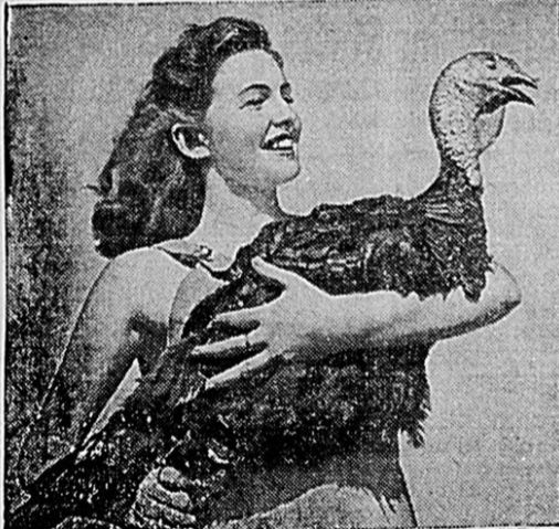
JOAN LESLIE—lissom, red-headed and sweet sixteen—is a native of Detroit. She traveled with her sisters, night club entertainers, and was at the Paradise Club on Broadway when talent scouts began to rave about her. She had appeared in several pictures for other producers before Warner Bros. signed her—so she was engaged not as an amateur, but as a most alluring ingenue. She's seen above with a talkative turkey, a tantalizing Irish smile, and Thanksgiving greetings to all the screen friends she has made.