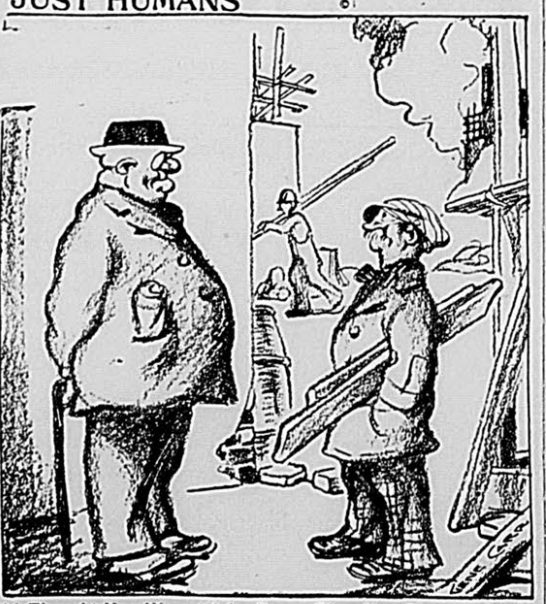
I Thought You Were All for Peace, Then You Throw a Brick

at Casey?" "That's Why I. Threw th' Brick!"