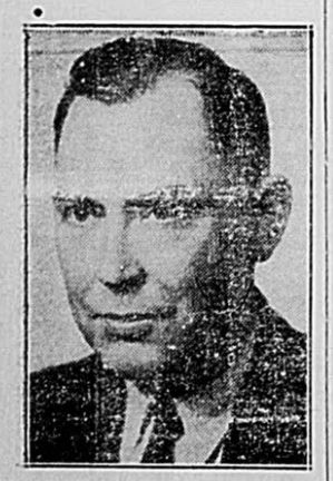
CANDIDATE FOR State Representative 124th DISTRICT

OLD ENOUGH— For Mature Judgment YOUNG ENOUGH— To Get Things Done