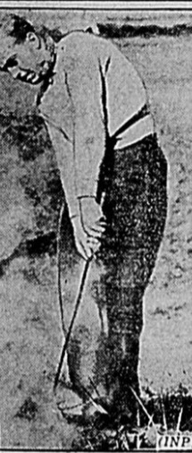
(KING OF GOLF)

CANNON FODDER? . . . Scenes such as the above are common on Tokyo streets these days as Japanese army leaders prepare to rush additional troops to the Peiping- Tientsin area of North China, where sev- eral thousand Japanese troops have clashed with the 29th Chinese Army.