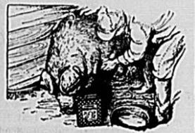
Wash the sow and disinfect the udder.

"A few days before farrowing time, the farrowing pen should be cleaned thoroughly..."