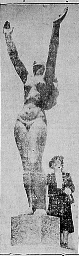
MODERN Statue of Liberty . . .

Draftsman Drafted SAINT JOHN, N. B.—Ad in a local newspaper: "Wanted—Draftsman to replace man called for military service. Do not apply if likely to be called for duty."