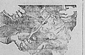
Worm pigs when eight weeks old.

"Vaccination of pigs for hog cholera at 5 to 6 weeks of age is recommended, if at all possible."