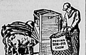
Feeding is an important factor, too!

"If the weather permits, the sow and her pigs should be hauled to a pasture about 10 days or two weeks after farrowing. This pasture should not have been recently used for hogs."