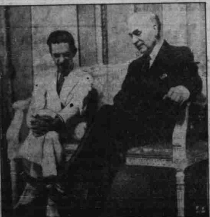
COLONIZATION WAS BANNED by Monroe doctrine, but 115 years ago riddle as a step toward colonization was unknown. Advocates of friendship through air, as well as by land and sea, is Secretary of State Cordell Hull seen with former Panama president, Ariza.