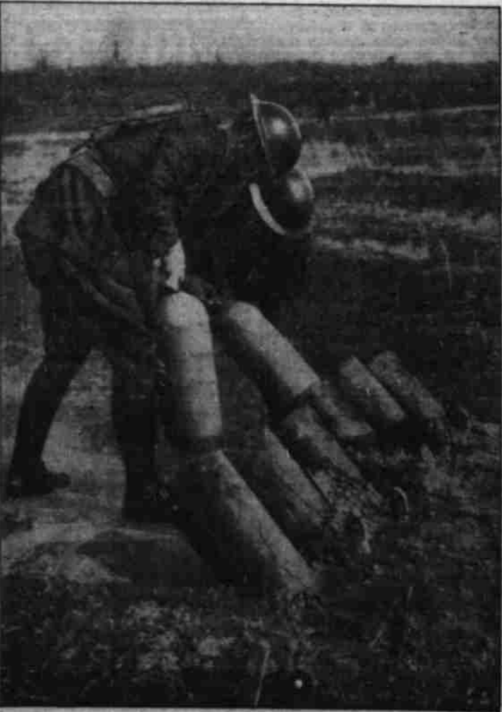
FOR A CHEMICAL WAR... chemical weapons in heavy development by Chemical Warfare service which recently demonstrated war equipment in Maryland. Above, soldiers load gas projectors preparatory to laying down smoke screen for maneuvers. Projectors are discharged by electricity.