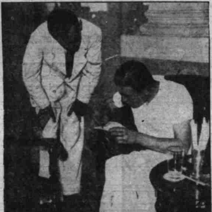
MORE THAN BROTHERLY LOVE is believed back of recent trans-Atlantic flight of three Italian planes landed at Rio de Janeiro by Bruno Mussolini, son of Italy's Il Duce. Soon after arrival, Bruno (right) autographed a greeting to the more than a million Italian residents in Brazil.