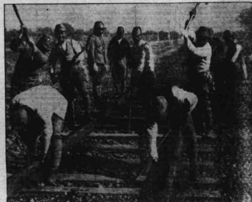
THEY'VE 'BEEN WORKING ON THE RAILROAD,' and these Japanese soldiers busy repairing Shanghai-Nanking railroad line along which troop shipment is heaviest are to be enjoying their job. The movement of soldiers recently drew comment from China's Generalissimo, Chiang Kai-shek, who said that "although Japan has mobilized more than a million soldiers... her influence is confined to a few cities, her troops dare not go beyond communication lines."