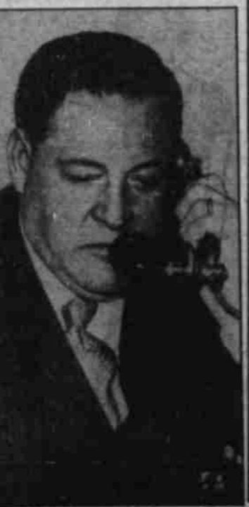
HIS FAITH in Democracy as a political principle was affirmed by Roberto Ortiz at his inauguration as president of the Argentine republic.