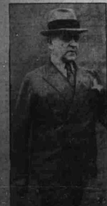
ROME HAILED away by Generalo Vargas setting up dictatorship in Brazil. He later said his role would "unify Commission over Fasces."