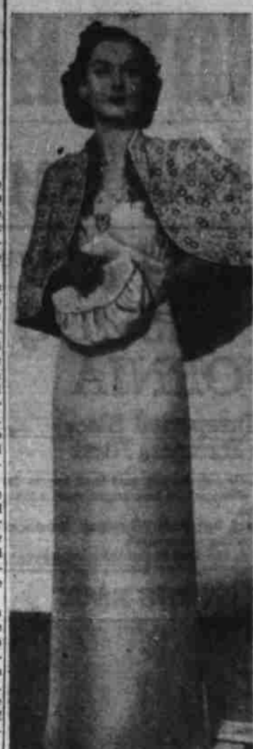
Garnet ostrich feathers line the brief beaded cape of an evening costume designed for Rosalind Russell of the movies. Dusty pink crepe makes it.