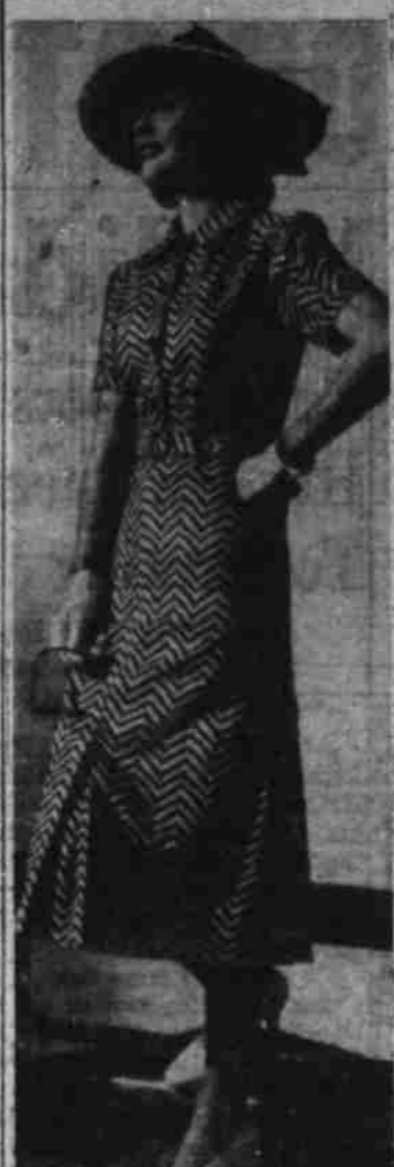
Cotton sheeting, stamped in brown and white chevron pattern, makes a trim spectator sports frock to wear down south. It is piped and buttoned in brown.