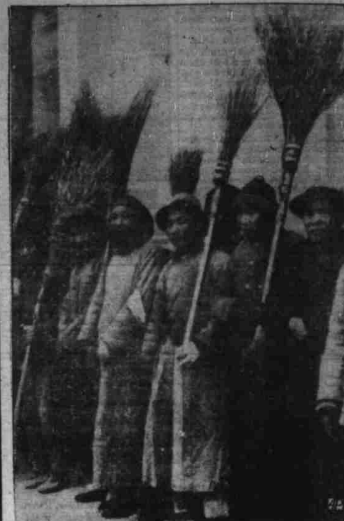
NEW BROOM SWEEPS CLEAN has slightly different meaning in Nanking, China, where Chinese civilians have been conscripted into street-sweeping parties. Cleanliness of the city was among steps entered when Japanese soldiers took over Nanking and put conquered Chinese under military rule.