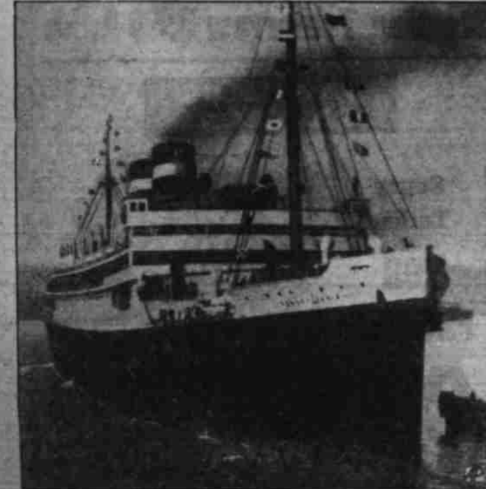
TO BOOM TRAVEL AND TRADE between U. S. and South America three Panama-Pacific liners—the Pennsylvania (above), Virginia and California, recently on California to New York route—are slated for service to east coast ports of South America under ownership of U. S. Maritime commission.