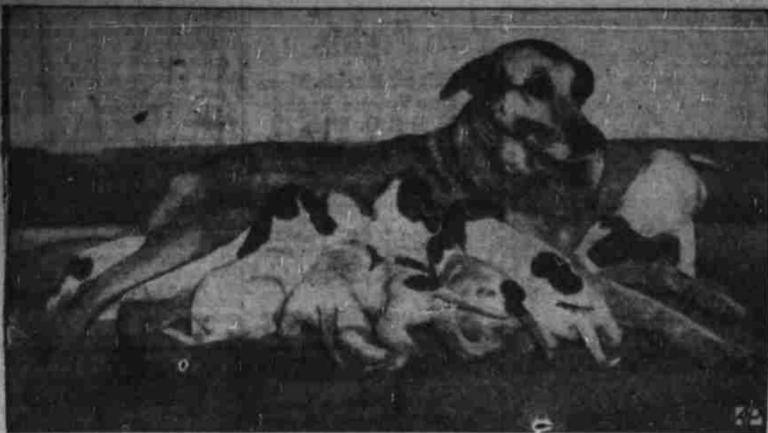
FRIEND TO DOGS AS WELL AS MAN is "Pal," a police dog in Memphis, who adopted a litter of pointer pups when the mother died. The pups were three days old when orphaned.