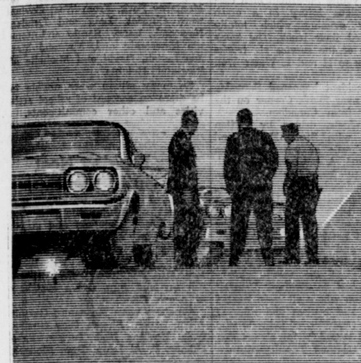
This is when your insurance agent has to go to work for you