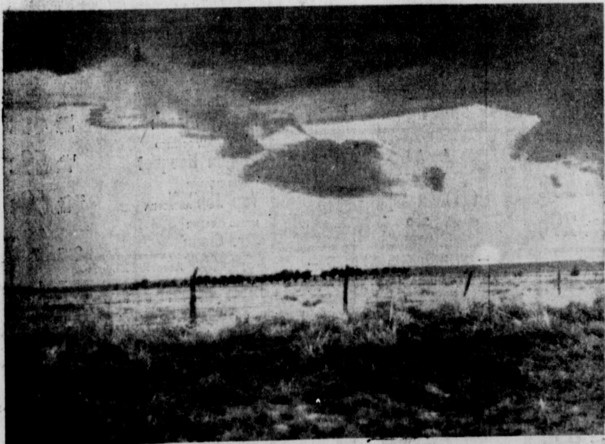
These heavy rain clouds seemed to congregate over Old Hansford Monday and when they had cleared away, 3.25 inches of water was recorded in gauges there, the heaviest amounts recorded anywhere.