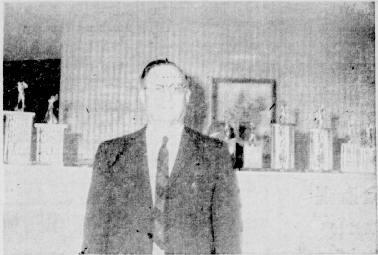
The annual Golf tournament sponsored each year by the First State Bank of this city will be this Sunday, Aug. 8.

Pictured above are just a few of the beautiful trophies being offered for the first two places in four flights. Prizes will be