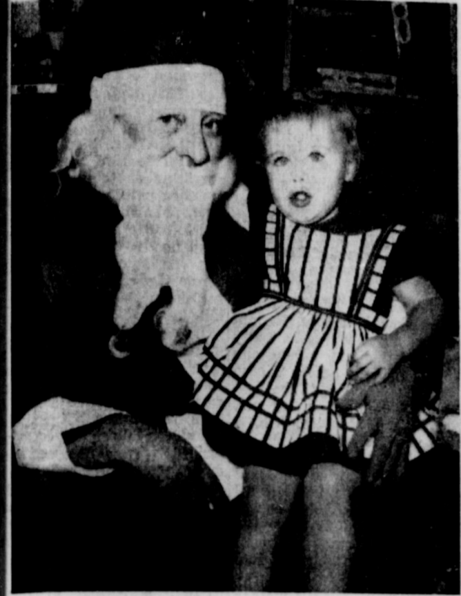
Santa To Be Here Saturday for orders!

Spearman, "A city with a plan for the future!"