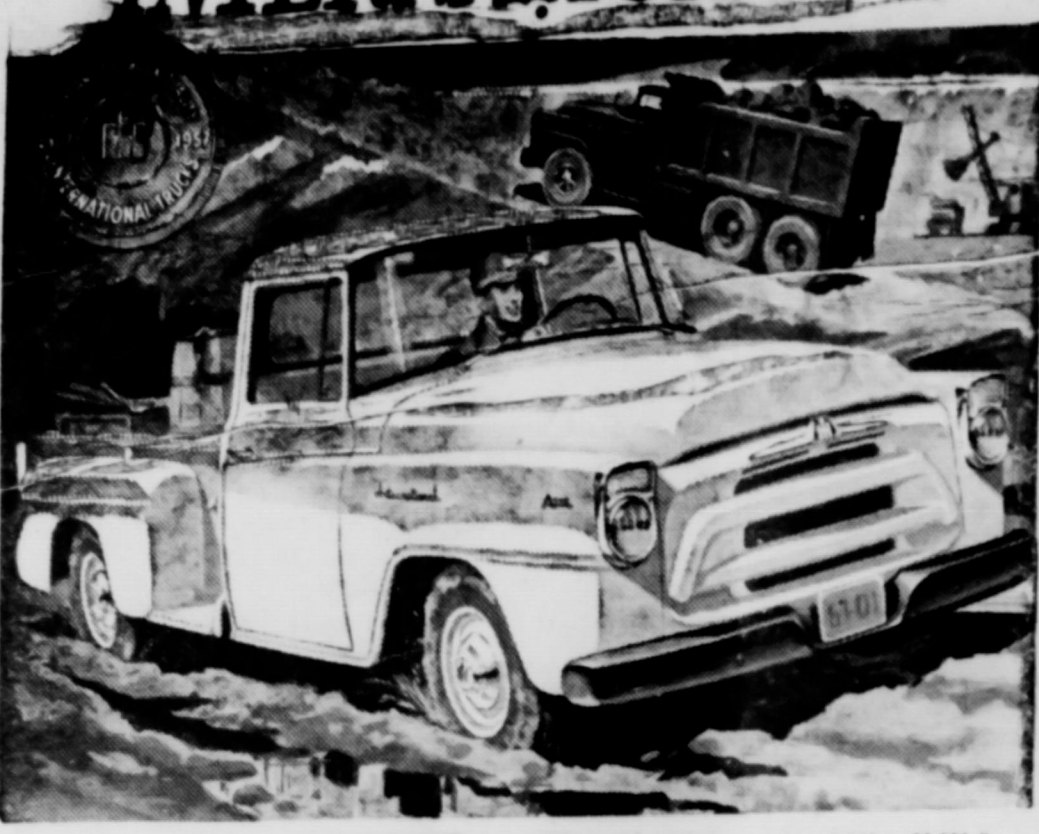
Golden Anniversary INTERNATIONAL all-wheel-drive models range from 7,000 to 33,000 lbs. GVW. Other INTERNATIONALS, to 56,000 lbs. GVW, round out world's most complete line.

Here's the truck that makes its own roads—a new Golden Anniversary INTERNATIONAL with four-wheel-drive!