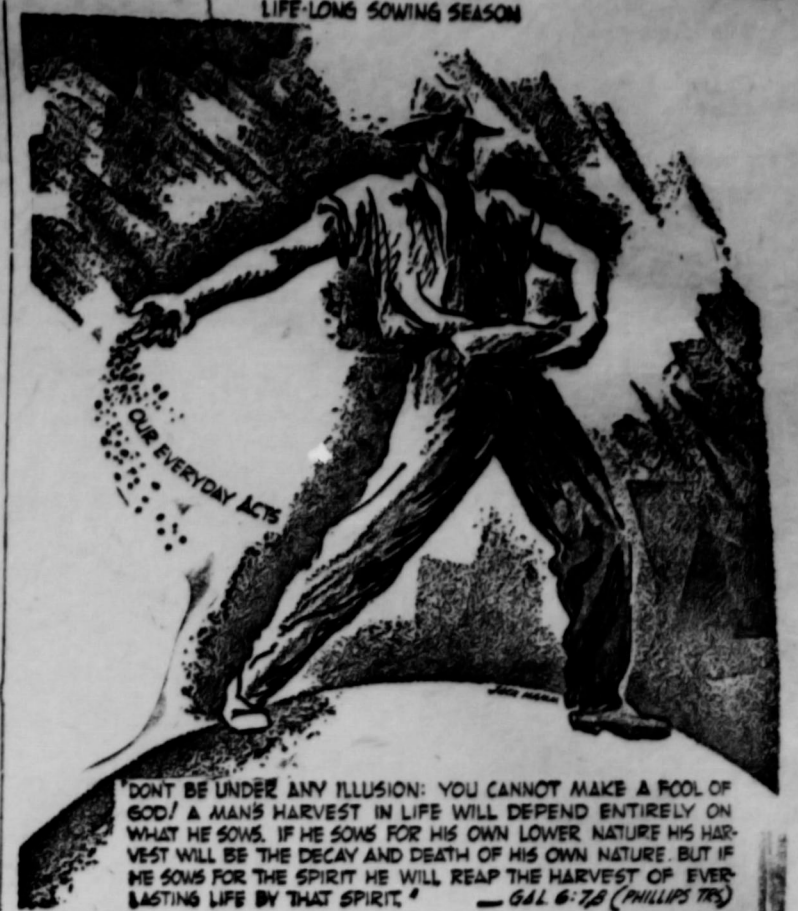
DON'T BE UNDER ANY ILLUSION: YOU CANNOT MAKE A POOL OF GOD! A MAN'S HARVEST IN LIFE WILL DEPEND ENTIRELY ON WHAT HE SOWS. IF HE SOWS FOR HIS OWN LOWER NATURE HIS HARVEST WILL BE THE DECAY AND DEATH OF HIS OWN NATURE. BUT IF HE SOWS FOR THE SPIRIT HE WILL REAP THE HARVEST OF EVER-LASTING LIFE BY THAT SPIRIT. — GAL. 6:7-8 (PHILLIPS TR.)