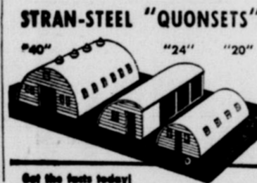
Get the facts today!

QUICK, PERMANENT, LOW-COST CONSTRUCTION "QUONSET 40": 40 feet wide; any length desired, in 20-foot extensions. Roller doors and four windows in standard end-panel. "QUONSET 24": 24 feet wide; length as desired, in extensions of 12 feet. Roller doors, solid panels available for front; walk door and window available in end-panel. "QUONSET 20": 20 feet wide; any length desired, in 12-foot extensions. Walk door and two windows in standard end-panel.