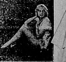
One of the many beautiful girls in Earl Carroll's Vanities show, coming to Amarillo for two performances Saturday, Jan. 21.