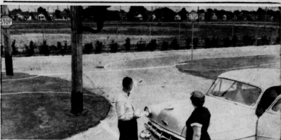
s for driving schools are urged by l most effective in a nationwide poll